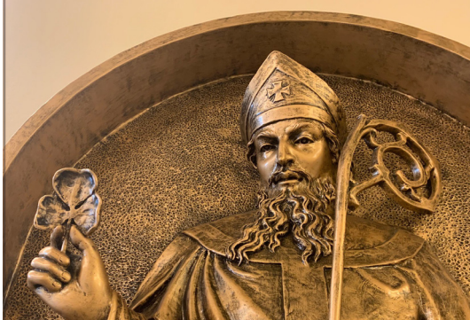
ST. PATRICK AT ASCENSION GARDEN

St. Patrick, whose Feast Day is celebrated on March 17th, is featured on the right side of the