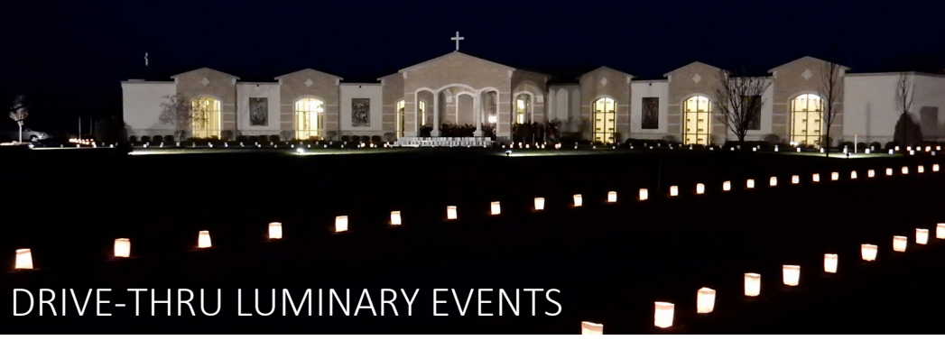
LUMINARY DRIVE AT ASCENSION GARDEN

If you would like to receive occassional emails, communicating our upcoming events, special hours, promotions and to access this quarterly newsletter, please email events@holysepulchre.org . We would be happy to add you to our list!