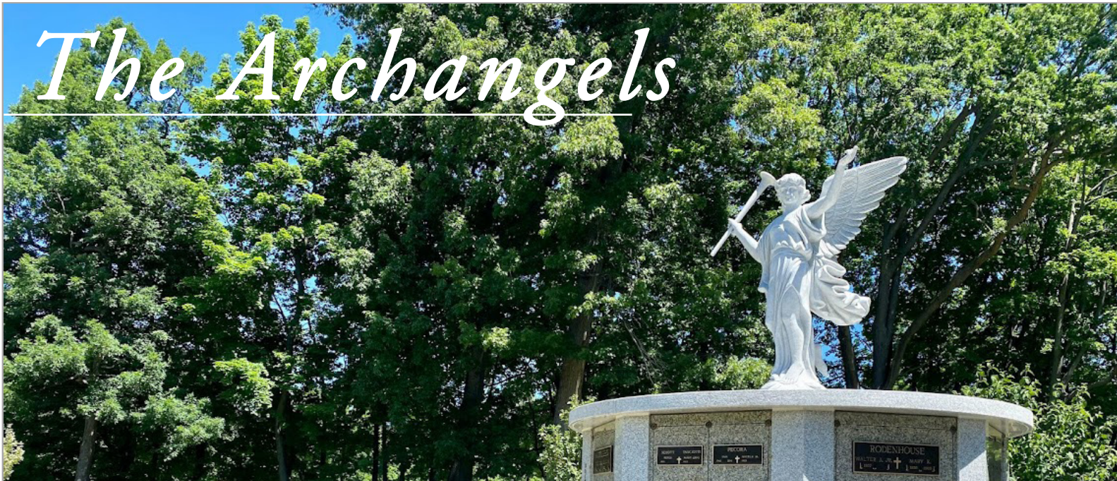
ST. GABRIEL IN ANGELS OF GOD CREMATION GARDEN

On September 29th, we celebrate the Feast Day of the three Archangels: St. Michael, St. Gabriel and St. Raphael. Their role in our life is different from the other Saints. We pray to the Saints for their intercession, but we also look to their lives for imitation and role modeling. Angels are different; they are spiritual creatures created by God for a particular purpose.